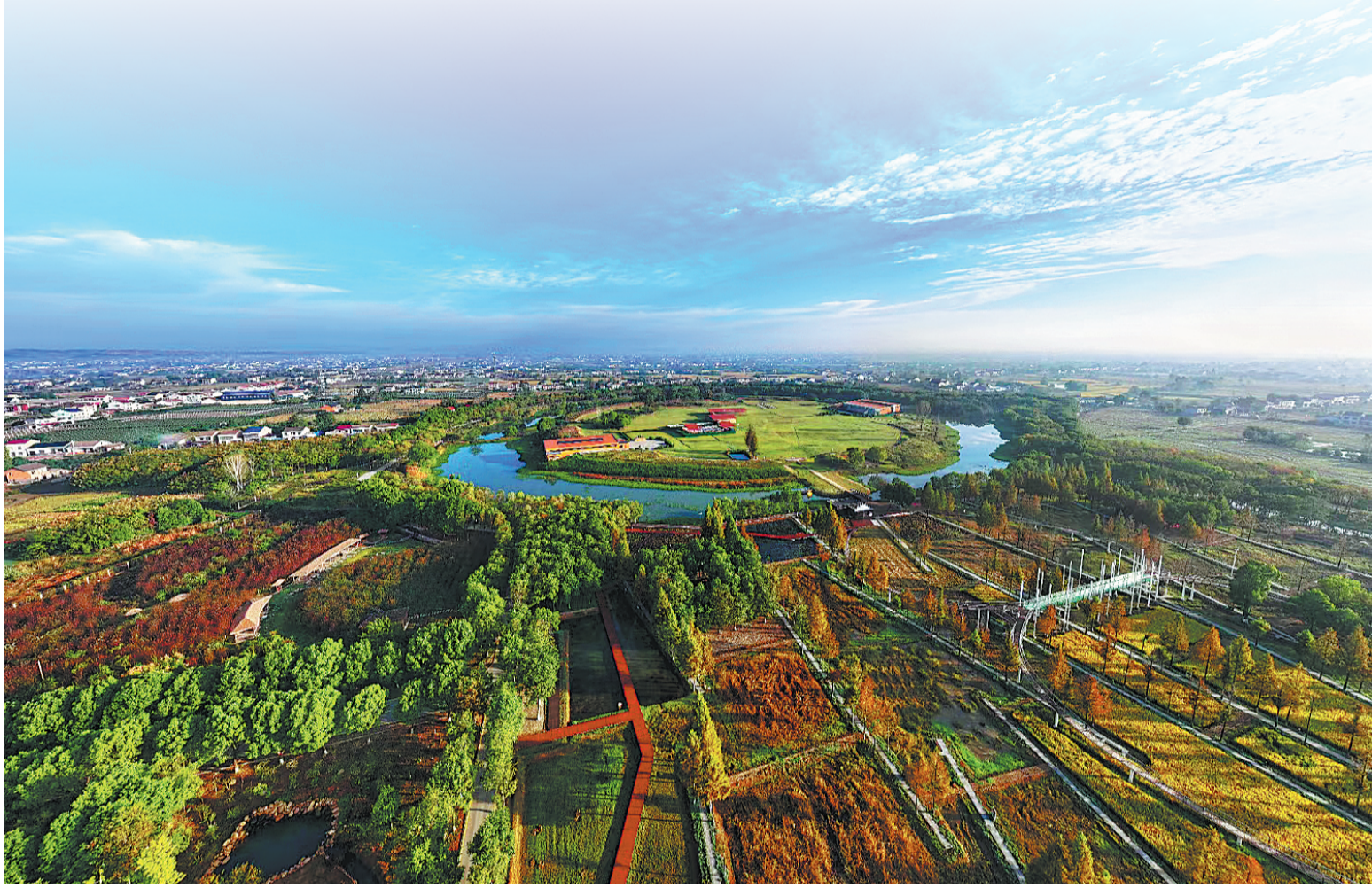
A bird's-eye view of Chengtoushan national archaeological site park.