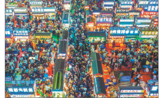
An aerial view captures the bustling Zhengding International Commodities Night Market in Zhengding county, Shijiazhuang, Hebei province, teeming with visitors.