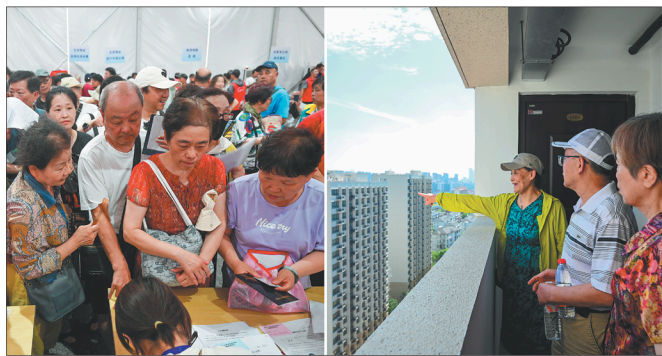
Left: Residents of the Pengpu No 1 Village in Shanghai's Jing'an district receive keys to their new homes on Sunday. Right: Residents inspect their newly renovated home on Sunday.