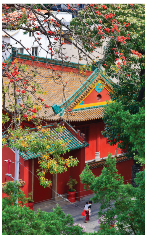
Above: The iconic red kapok trees are in bloom at the Site of the Peasant Movement Training Institute in Yuexi district. Known as the "hero flower" locally, kapok blossoms symbolize courage and resilience, lending depth to Guangzhou's status as a "hero city" with its profound significance in modern Chinese history.

Springtime in Guangzhou, Guangdong province, is a celebration of color and life, earning the city its reputation as China's perennial "city of blossoms". Residents and tourists marvel at the vibrant azaleas and kapok blossoms — the city's official flower — lining the boulevards, alongside various other species in bloom.