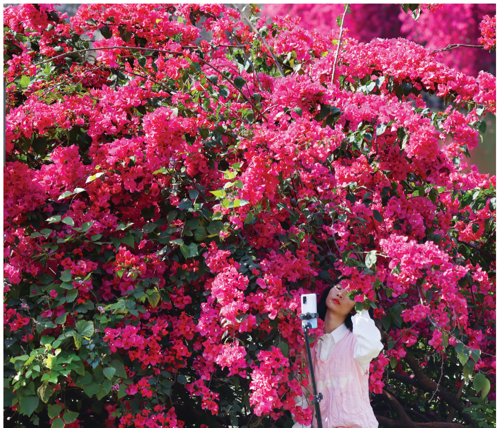
Above: A sea of bougainvillea creates the perfect natural backdrop for photos at the South China Agricultural University in Tianhe district. Left: Bauhinia trees are in full bloom at Haizhu National Wetland Park, casting vibrant shades across the serene landscape.

This annual floral exuberance highlights both Guangzhou's natural beauty and its commitment to environmental harmony and sustainable development. As one of the first cities in China to welcome spring, the southern metropolis invites residents and visitors to appreciate its sea of blossoms and find peace of mind.