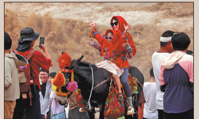
Tourists ride on a donkey in front of the Hukou Waterfall on the Yellow River in Jixian county.