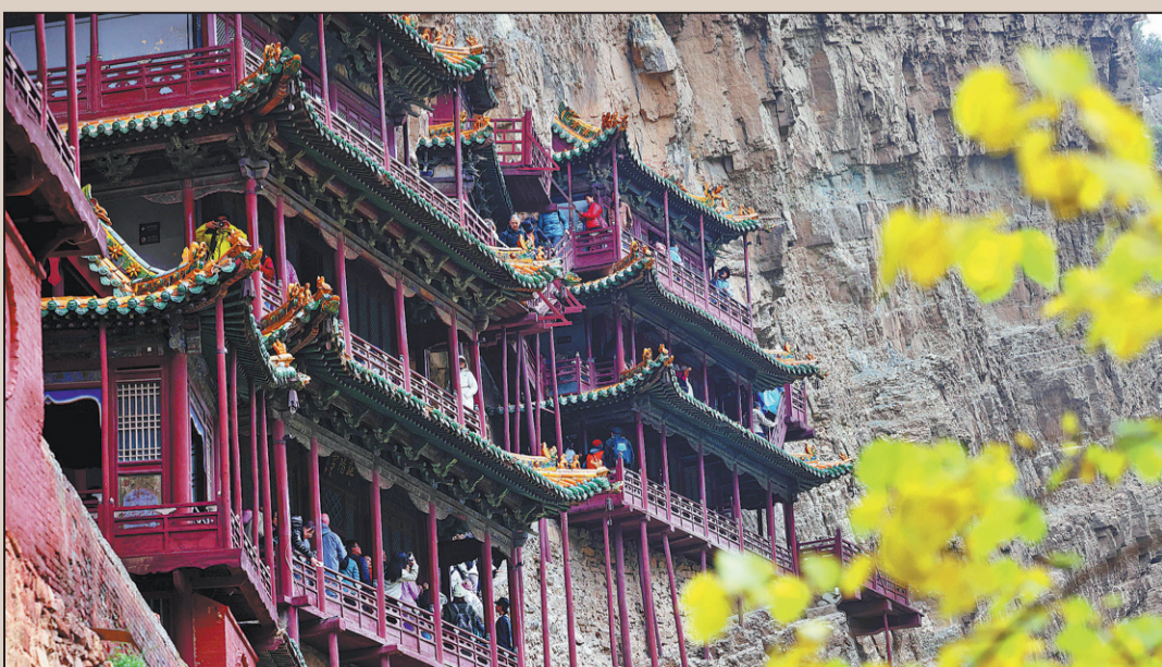
Left: Tourists visit the Xuankong (Hanging) Temple in Hunyuan county, Shanxi. Right: Visitors descend a stairway leading to the wall of Pingyao Ancient City.