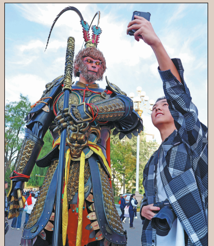
A visitor takes a selfie with an effigy of Wukong from the video game, Black Myth: Wukong , in Taiyuan.