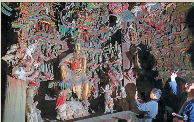
Tourists take photos of painted sculptures at Guanyin Temple in Changzhi, Shanxi.

Contact the writers at zhuxingxin@chinadaily.com.cn