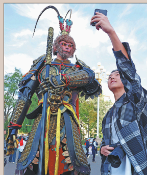
A visitor takes a selfie with an effigy of Wukong from the video game, Black Myth: Wukong , in Taiyuan.