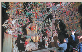
Tourists take photos of painted sculptures at Guanyin Temple in Changzhi, Shanxi.

Contact the writers at zhuxingxin@chinadaily.com.cn