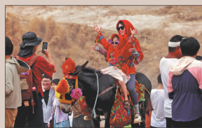
Tourists ride on a donkey in front of the Hukou Waterfall on the Yellow River in Jixian county.