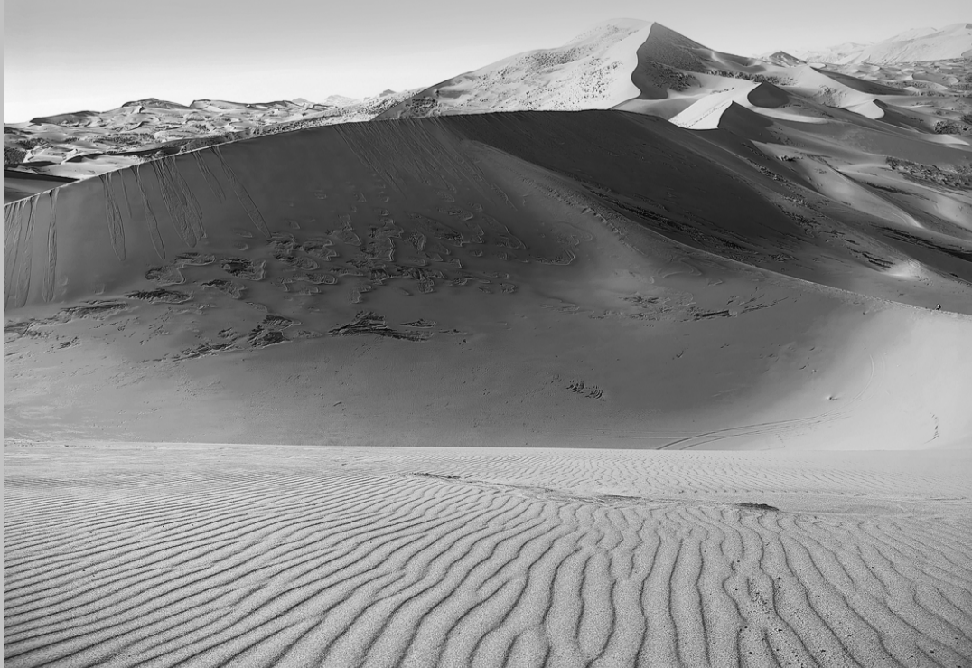
Bilutu Peak in the Badain Jaran Desert, Alshaa Right Banner, Inner Mongolia autonomous region seen on Sept 21.