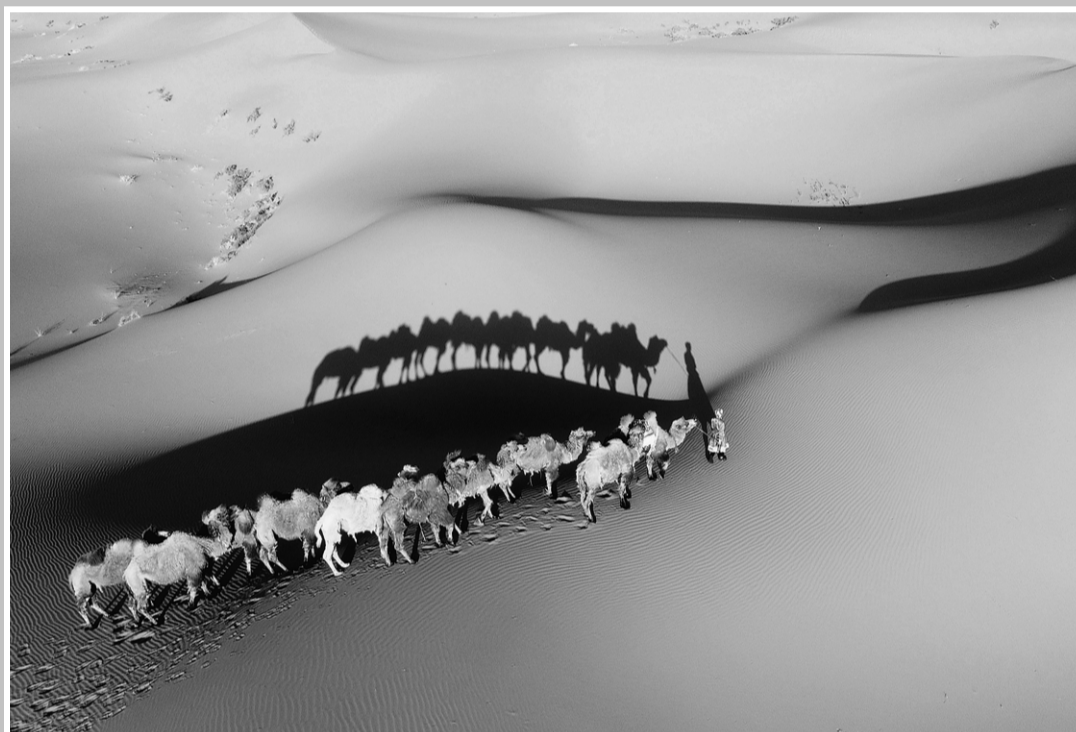
Top: Su Min Jaran Lake in the Badain Jaran Desert, Alshaa Right Banner, Inner Mongolia autonomous region, pictured on Sept 20. Above: A herder walks with his camel caravan in the Badain Jaran Desert.

"During the World Heritage application process, each village organized meetings with the herders, listened to our opinions, and addressed our concerns. Once we received assurances that we could continue to live here