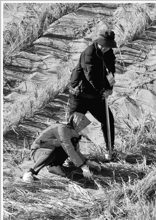
Clockwise from left: Volunteers from Gansu province help lay sand-barriers in the Badain Jaran Desert in October. Tourists walk through the desert. Camels drink water in a lake of the desert on July 31.