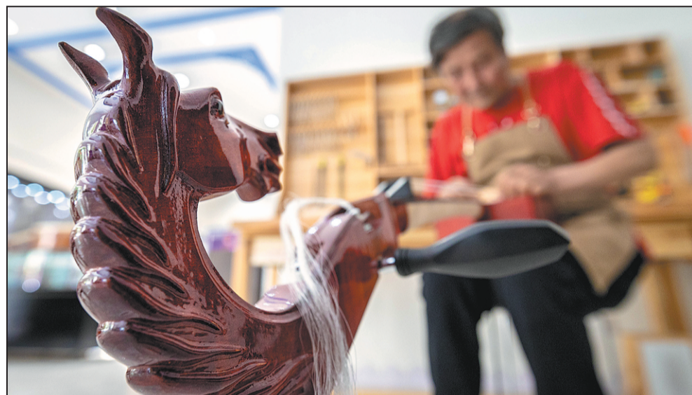
The horse's head is not only a decorative element of the morin khuur but also a cultural icon.

spirit and rich cultural tapestry of ethnic Mongolians. Its melodies echo through time, carrying with them the stories, dreams, and aspirations of a people deeply connected to their land, their horses, and to each other.