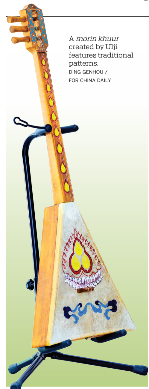
A morin khuur created by Ulji features traditional patterns.

Online Watch the video by scanning the code.