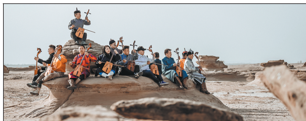
The Uxin Banner Morin Khuur Symphony Orchestra of China is devoted to keeping the Mongolian music legacy alive and thriving in the modern era.

authorities, the ensemble initially comprised nearly 30 morin khuur virtuosos.