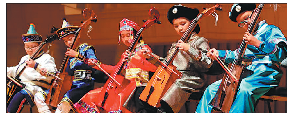
Young performers show their talent on the morin khuur , after receiving training at a school founded by Khetsuumanlai.

folk melodies while incorporating traditional instruments, such as bamboo flutes, sanzhian (three-stringed Chinese lute) and yangqin (Chinese hammered dulcimer).