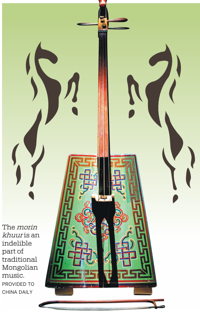
The morin khuur is an indelible part of traditional Mongolian music.