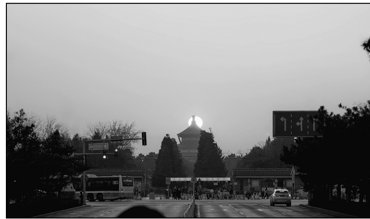
The sun sets behind the Temple of Heaven.

These locations were built with regard to annual solar movements, for example Qianqing Palace (The Palace of Heavenly Purity), the Seventeen-Arch Bridge in the Summer Palace, which is illuminated during the winter solstice, and the Temple of Heaven, with the sun setting per-