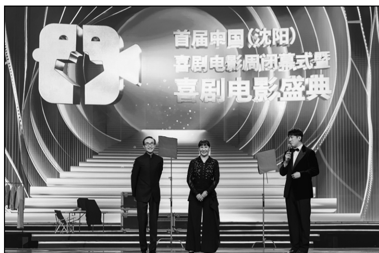
Comedian Gong Hanlin (left) and his wife comedian Jin Zhu (center) at the closing ceremony.