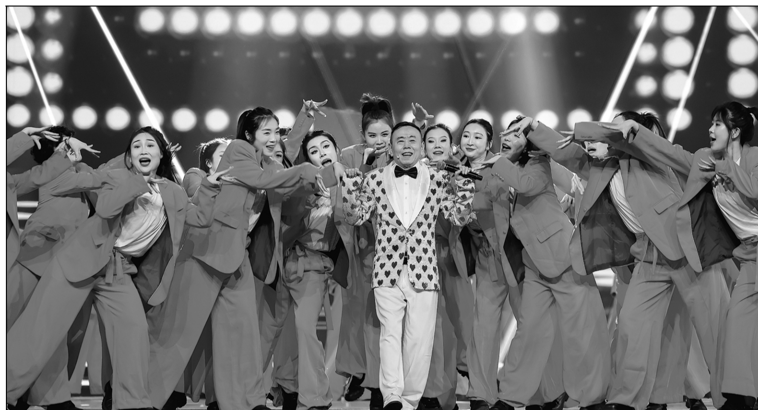
Comedian Pan Changjiang (center) performs during the inaugural China (Shenyang) Comedy Film Week.